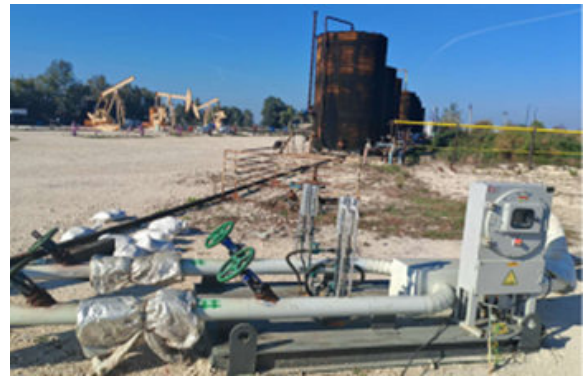
Equal Dryness Steam Distributor