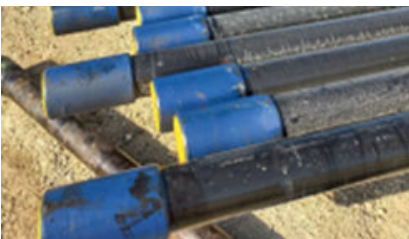
Vacuum Insulated Tubing